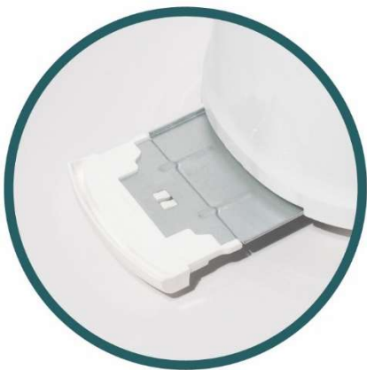
Removable Crumb Tray